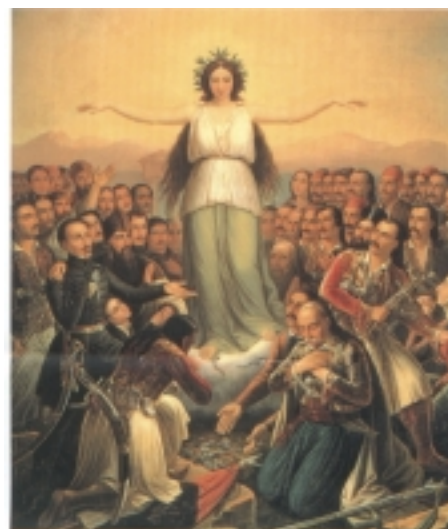
ΕΘΝΙΚΗ ΠΙΝΑΚΟΘΗΚΗ-ΜΟΥΣΕΙΟ ΑΔΕΣΣΑΝΑΡΟΥ ΣΟΥΤΣΟΥ ΑΘΗΝΑ-ΜΟΝΑΧΟ Τέχνη και Πολιτισμός στη νέα Ελλάδα 5/4 - 3/7/2000 ΣΟΦΙΣΤΟΣ ΕΘΝΙΚΟ ΚΑΤΑΣΤΑΣΙΑΚΟ ΜΟΥΣΕΙΟ 2000 Αθ. Ν: 03400

cal buildings – public, and private. There is a catalogue available with historical essays, but it is in Greek only.