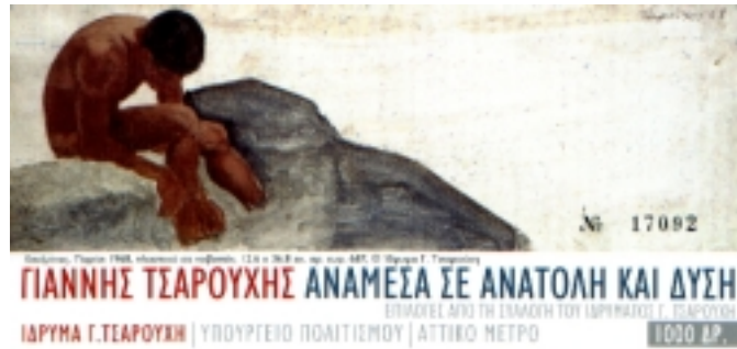
Yiannis Tsarouchis, “the bather,” 1968, The Tsarouchis Foundation

I was lucky enough to catch an extended “Yiannis Tsarouchis: Between East and West” exhibit, showcasing some of the artist’s best work. Tsarouchis is one of Greece’s top – many will say most important – artists. It was indeed a feast for the eyes to see again work that has documented so much of what Greece has experienced in its cultural development in the twentieth century. The works were provided